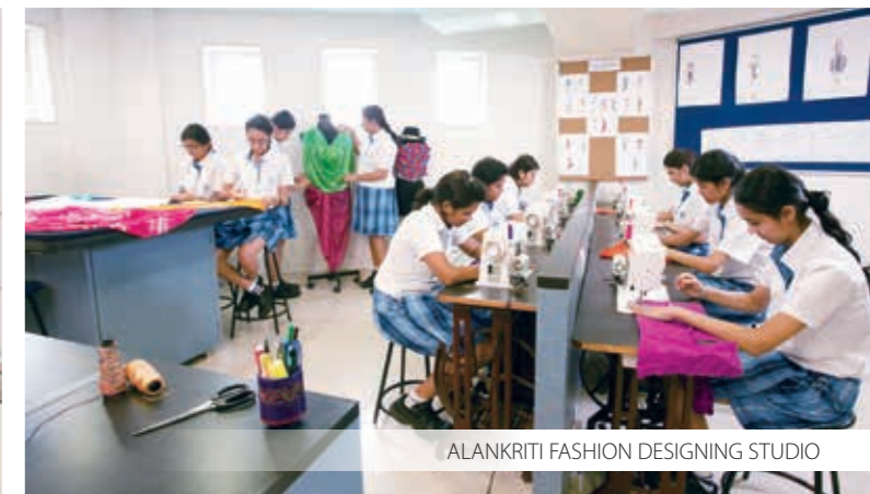
ALANKRITI FASHION DESIGNING STUDIO