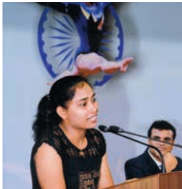
Artistic Gymnast, Olympian Ms. Dipa Karmakar inspired the students to chase their dreams.