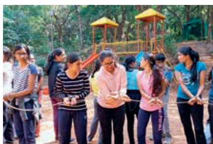
Attaining an all round personality