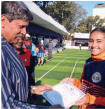
Chief Guest Shri Kapil Dev felicitating a student during Annual Sports