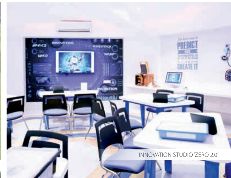
INNOVATION STUDIO 'ZERO 2.0'