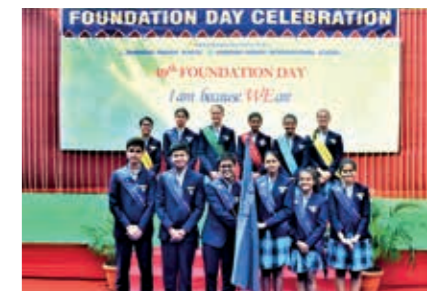
Proud Members of The Student Council